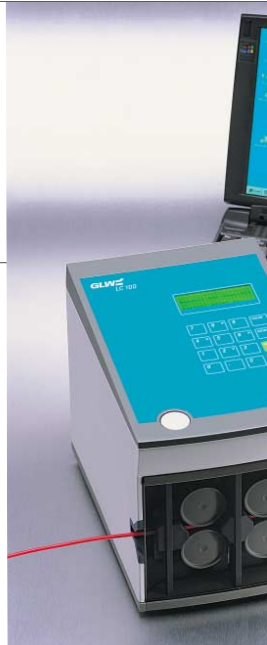
Repeat cutting orders can be processed and documented.

With the software supplied with each LC 100 it is possible to process and document repeat cutting orders directly on the PC and to transfer them to the LC 100 .